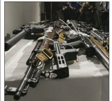
Ezinye zezikhali ezingekho emthethweni esezike zabanjwa emkhankasweni wamaphoyisa KwaZulu-Natal.