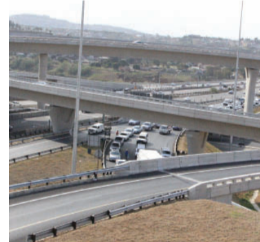
Umngeni Interchange eThekwini uyingxenywe yokuthuthukiswa komnotho esifundazweni