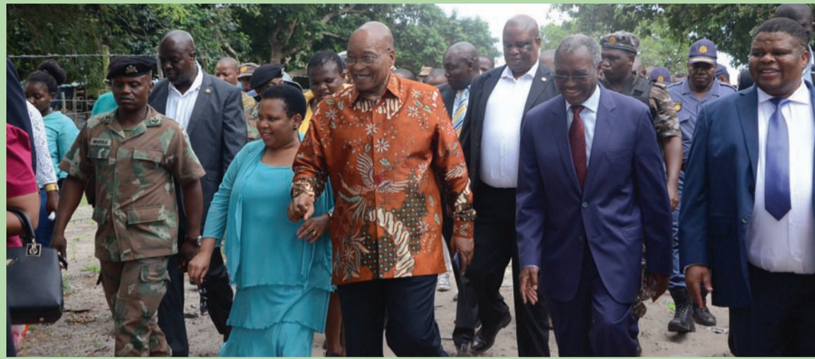
Ithimba likahulumeni kuzwelonke nasesifundazweni liholwa nguMongameli uMnu Jacob Zuma noNdunankulu uMnu Willies Mchunu ngenkathi kunomkhankaso wokulwa nobugebengu emingceleni phakathi kweNingizimu Afrika neMozambique.